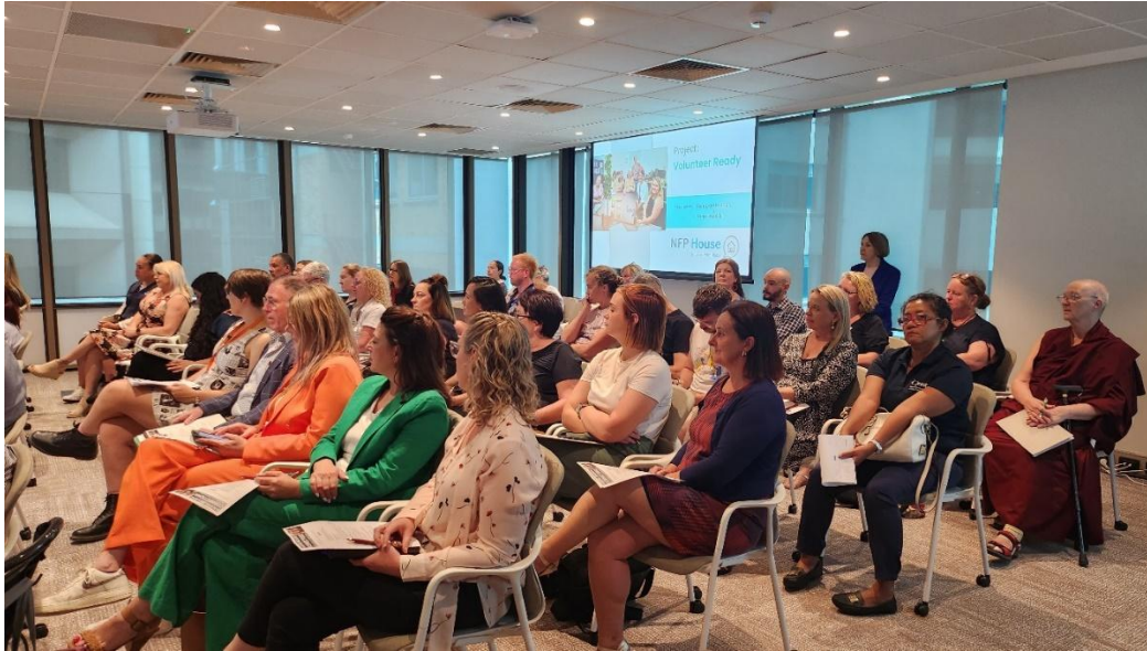
Photo 4 Building inclusive connections audience

On this session, Volunteering Queensland launched the Volunteer Leadership Network, as a space to join like-minded professionals across the volunteering ecosystem to share opportunities, challenges, and insights. It was also the opportunity to remind attendees about the Volunteering Queensland services offered to members and non-members and ask for input from the audience about training topics for the next year.